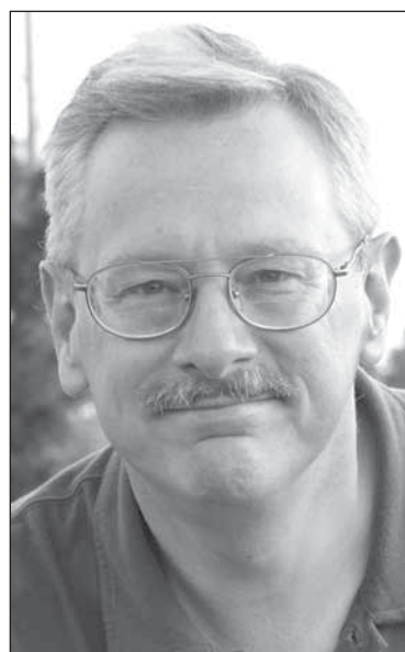
Senator Jim Rosapepe

Another way we can help local students is the legislative scholarship program. Each Senator is allocated funds for scholarships to students in our district who attend Maryland colleges. Appli-