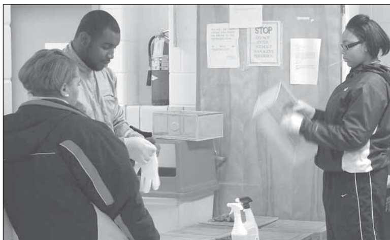
Students from Beltsville's High Road Upper School working at Sheppard's Cove.