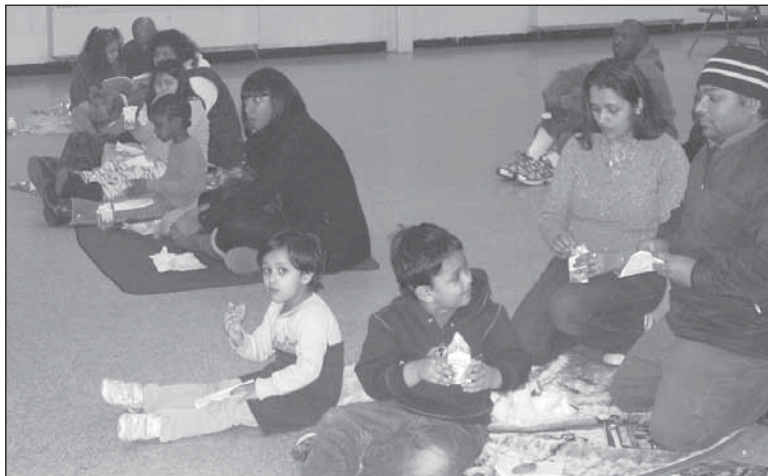
Children and Parents gather for Calverton's Book, Blanket and Bear event.

dren is one of the most important things you can do to help your children on the road to success. The American Academy of Pediatrics (AAP) "strongly recommends reading to children every day, starting after they are first born," because "reading stimulates the development of the brain, language and a closer emotional relationship with a child." Not only does it give parents a special time to bond