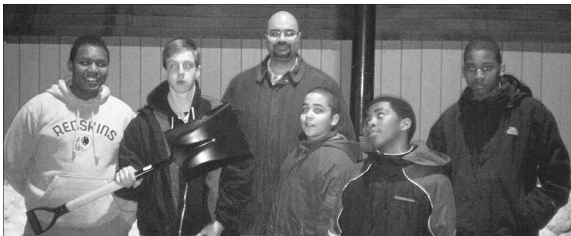
Scouts cleared the walkways at Emmanuel United Methodist Church