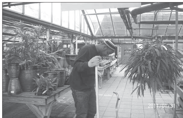
A student from Beltsville's High Road Upper School working at Behnke Nurseries Co.

Students also have an opportunity to develop job/career specific skills through participation in "job shadowing" activities with local business in the areas of their choice. As a result, the High Road Upper School has made it a high priority to establish a myriad of local business partnerships to not