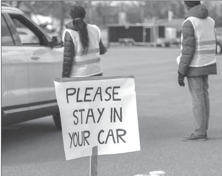
Members of the Pathfinders give instructions and direct traffic at The Beltsville Seventh-Day Adventist Church first ever drive-in church service.

The Beltsville Seventh-Day Adventist Church had a first ever drive-in church service on Saturday March 6, 2021 at 3 pm. It was completely organized and run by 10- to 17-year-old kids, who are members of Beltsville Broncos pathfinder club. People came for the service and stayed in their cars. About 30 cars lined up in the parking lot for the service. A stage was set up for this service and clear instructions were posted for the attendees. The audio for the service was transmitted through FM transmitter. Attendees were able to tune in and listen in their own cars as they watched the service in the stage. At the end of the service the attendees applauded with an exuberant honking of the car horns. It was a blessed experience for everyone.