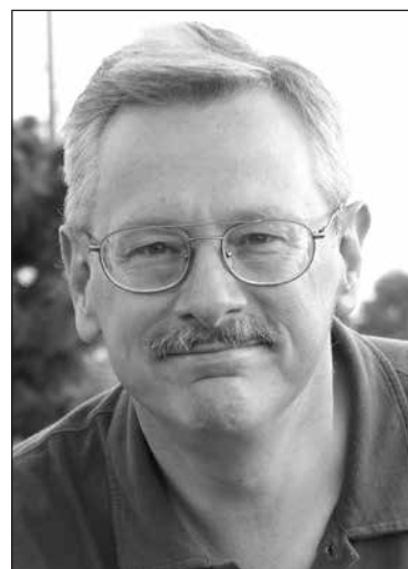
Senator Jim Rosapepe

allocated funds for scholarships to students in our district who attend Maryland colleges. There are so many deserving students in Beltsville. With college tuition a struggle for many families, we need to do everything we can to help hardworking students get a good education. We can't help everyone with Senatorial Scholarships, but we can certainly help some.