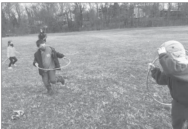
Wolf Den playing hula hoop tag