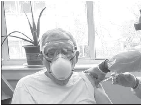
A Riderwood resident receiving the COVID-19 vaccine just steps away from his apartment home.

vaccine at Riderwood has now received both doses and look forward to safely enjoying the abundant on-campus amenities, dining experiences, and friendships that are hallmarks of Riderwood’s active, vibrant lifestyle. Residents, staff and visitors continue to take precautionary measures, including wearing masks, maintaining social distance and frequent handwashing, to keep each other safe and well-protected.