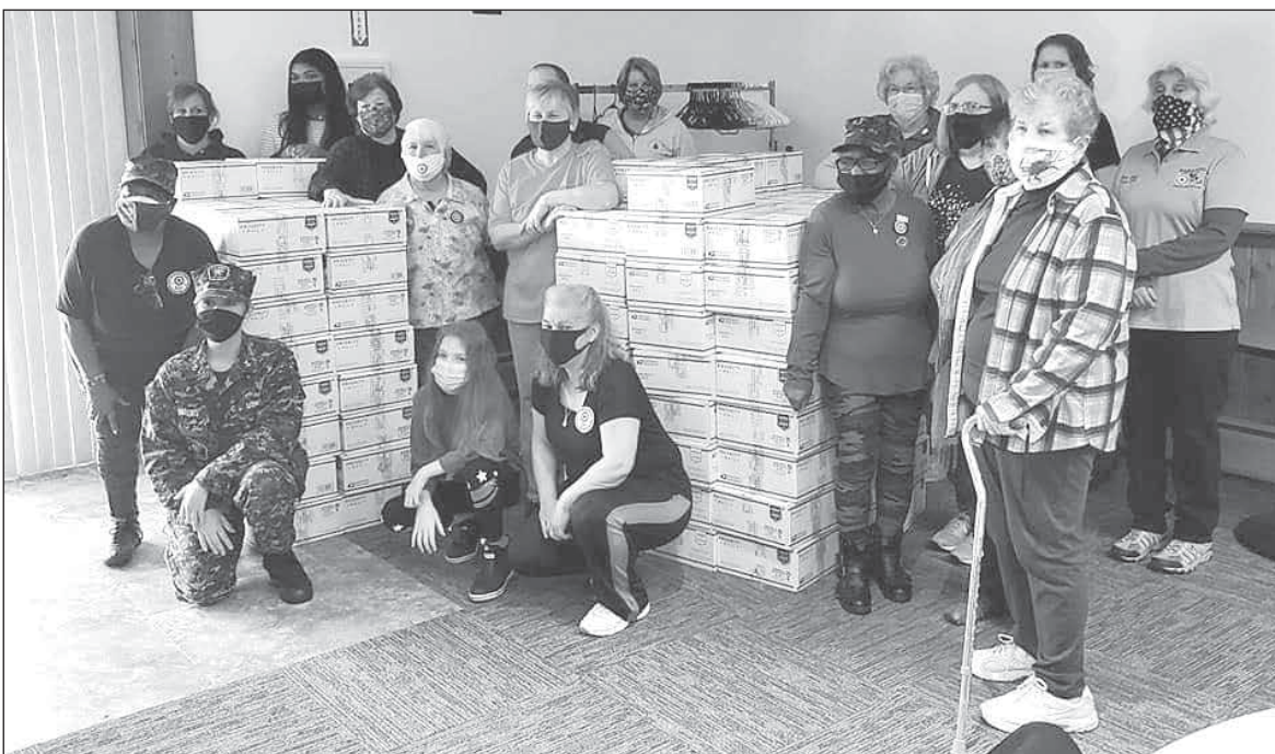
Pictured above are members of the American Legion family including the Juniors and the Cadets who packed 100 care boxes for our Ooactive Military through the Juniors program "Operation We Care."