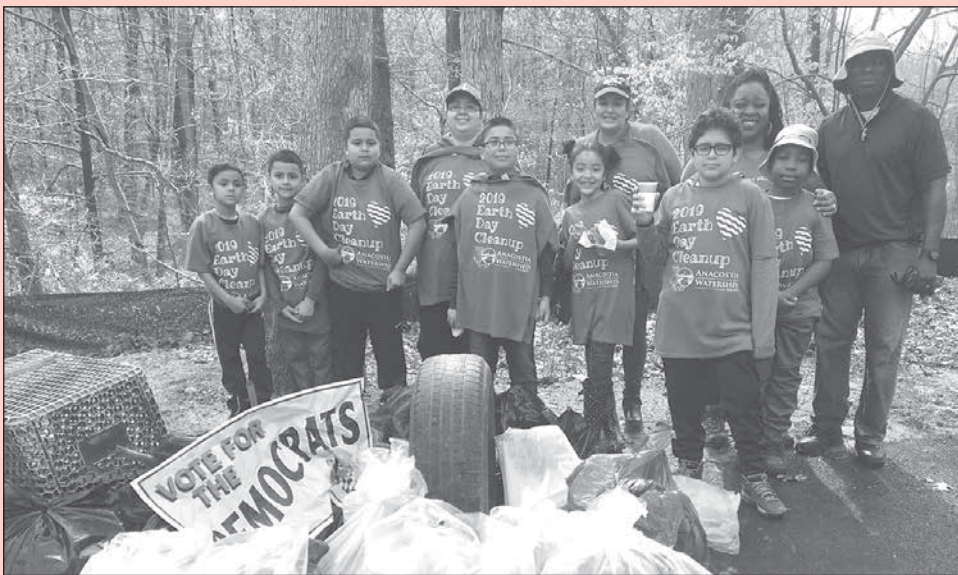
Some of the 2019 volunteers at the AWS Earth Day Clean Up at Little Paint Branch park